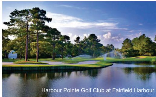
Harbour Pointe Golf Club at Fairfield Harbour