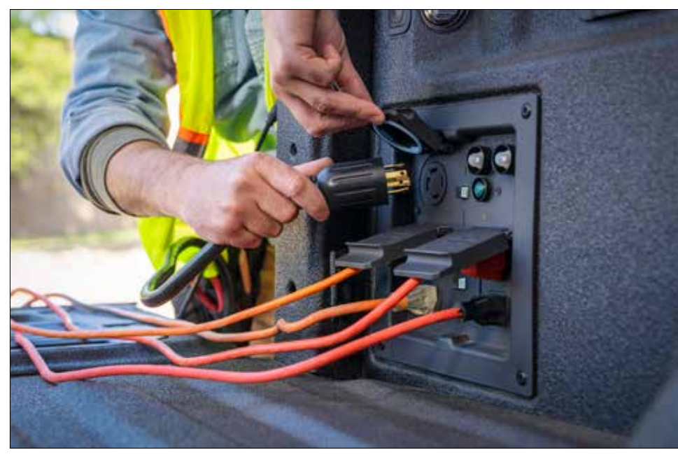
APRIL 2021 • TIDELAND TOPICS • CAROLINA COUNTRY • A

Learn more about this feature starting on page F. It's also a timely reminder to invest in a carbon monoxide detector for your home.