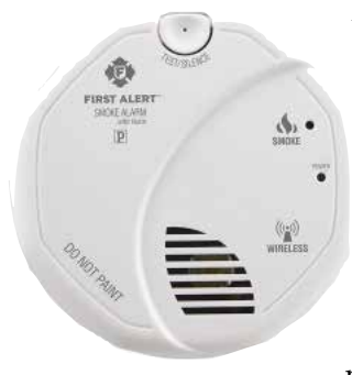
Smoke detectors have a 10 year life-span which makes a combination detector an ideal retrofit

monoxide sensors. Units that have both features generally start at around $40 and are often discounted by building supply stores when buying more than three.