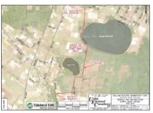
The engineer's rendering of improvements to the Dowry Creek circuit.

The engineer's rendering of the eventual tie-line for the Merritt and Dawson Creek circuits