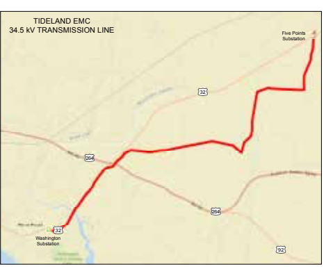
The subtransmission route between the Five Points and Washington substations.

Iron poles will replace all 141 existing wooden poles. To date, 12 have been installed and can be seen on Ambrose Road in Pinetown.