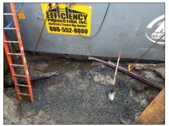
First damaged transmission line exposed