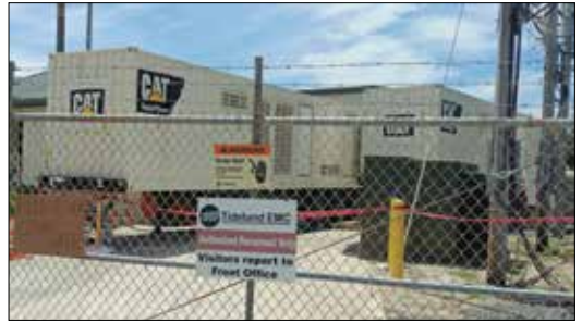
Three mobile generators provided electricity for Tideland's Ocracoke members