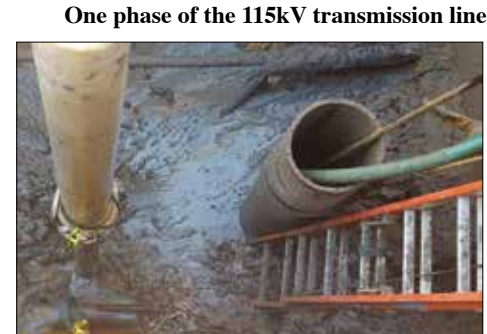
Splicing experts repair the first line. As excavation continued for the third cable the site filled with water.