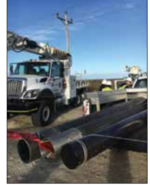
Intelli-pole installation at Ocracoke

While the emergencies grab the headlines and garner most social media likes, there's plenty of important work being done everyday to ensure greater