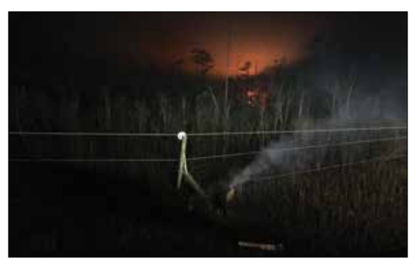
Tideland pole succumbed to the Whipping Creek Fire in April 2016.

We completed the purchase of property for a new substation in Craven County to serve Fairfield Harbour and surrounding communities. The project will not only alleviate growing load concerns,