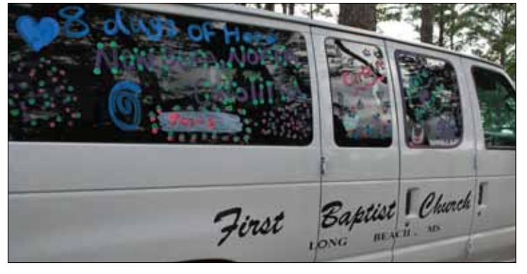
Bound from Long Beach, Mississippi to Pamlico County