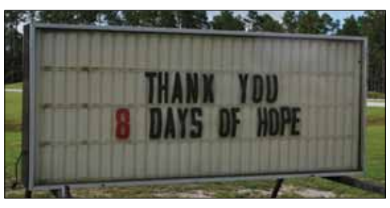
Thank you signs dotted county roadways

To learn more about Tybor's organization visit www.eightdaysofhope.com. Please contact the Baptist Men or United Methodist Disaster Relief to find out where you can still volunteer in the Tideland EMC service area.