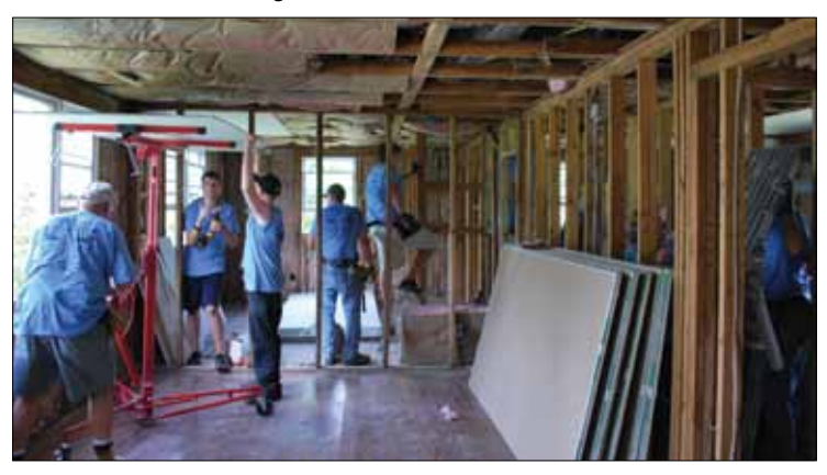
Crews lost a half day of work due to tropical storm Beryl