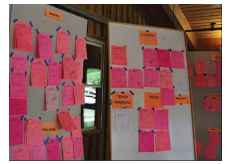
EDOH command center where volunteers sign up for jobs each day